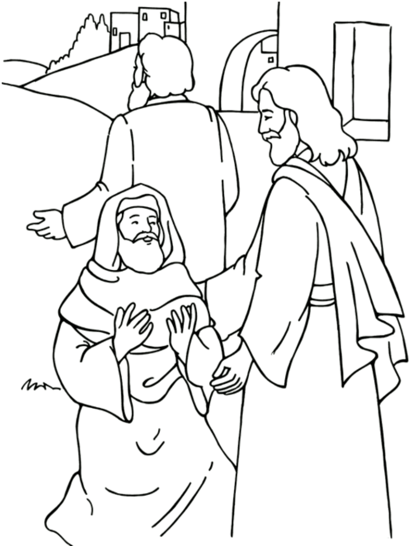
The Ten Lepers Luke 17:11-19